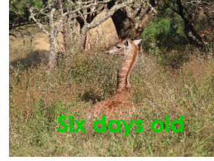
Six days old