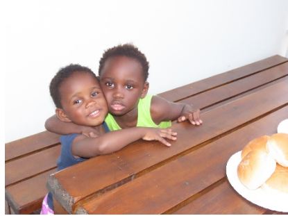
At the beach!

PO Box 33 Hilton 3245 South Africa +27 72 110 6332